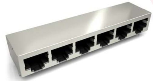
(Series Image-Reference Only)